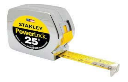
Figure No. 4: Measuring Tape