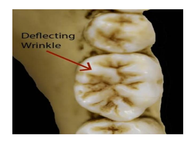
Figure No. 5: Deflecting wrinkle in mandibular first molar

The forensic DNA profiling provides information on sex, parentage and species. Teeth plays a better source of DNA due to its hardness. It is seen in pulp and cementum. The intact teeth without any pathology, teeth retained in the sockets, multi-rooted teeth and even impacted tooth act as a good source of DNA. Crushing entire tooth, vertical split, horizontal section, endodontic access and cryogenic grinding are some of the technique used to extract DNA from the tooth. Once the tooth is selected, it should be decontaminated otherwise it affects the outcome of results from DNA analysis. It can be done using sodium hypochlorite or UV light. Thus DNA extracted from teeth can be analysed for sex chromosomes and AMEL genes to determine the sex. The AMEL genes are located in X and Y chromosomes of genes. Therefore male population have two non- identical AMEL genes and female population have two identical AMEL genes (Alvarez-Sandoval et al., 2014).