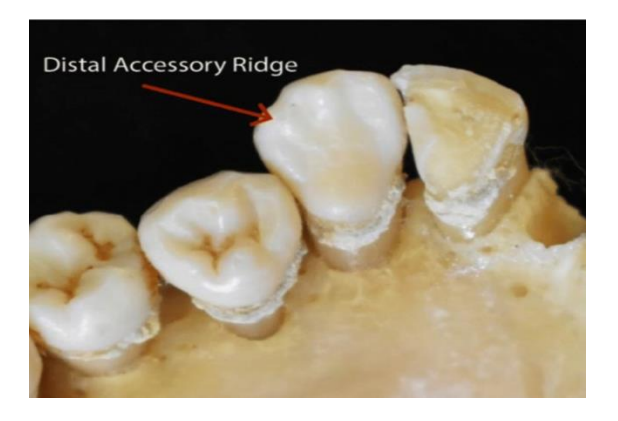
Figure No. 4: Distal Accessory Ridge in canine

The non- metric traits like distal accessary ridge in canine (Figure No. 4) and deflecting wrinkle in mandibular first molar (Figure No. 5) are seen in male population. Even if the mandible is completely edentulous the gonial angle of mandible helps in identification of the sex. The angle between 80-90 degrees is for male and angle between 110-120 degress is for female population.