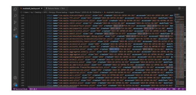
Figure No. 6: Shows the create date of a specific application

• After the data is recovered and extracted, the next step is to analyze and examine the data obtained, sometimes, the cloud backup file might not be in a readable form, so in that case, the backup file has to be converted into readable form via FTK Imager.