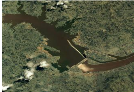
Figure 4 Environmental impact of three gorges dam

Power Generation – The three gorges dam is one of the important component for the China's energy program as well as the power production. The power generation is also significant as it is helpful in measuring the proportion of balance of the energy sources and hence the electricity is transmitted from west to east and also unifying the electricity supply arrangement for the entire country. It is noted that the total capacity installed for the three gorges dam is approximately 18,200 MW having the normal input of 84.7 TWh. After all that aspect it is concluded that the Three Gorges Project is supposed to be the leading station for the national grid in the future aspect of Three Gorges Dam Project (Huang and Wu, 2018)