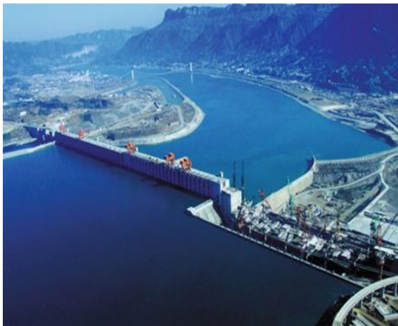
Figure 1 Three Gorges Dam

The Three Gorges Dam also termed as TGD is considered as one of the largest water project of China. This project was famous as in the history of the world as well. Like it is famous it was also being controversial because of numerous factors like economic impact, massive environmental impact and the social impacts. The Three Gorges Dam is positioned at the upper reaches of the Yangtze River and hence known as a significant comprehensive Hydropower project. This project is an incredible project which affects the ecological environment and shows the impact on the downstream survival of animals. The Dongting Lake is one of the largest lake that join the Yangtze River and the three gorges dam is basically stretched two kilometers more than across the greatest river i.e. Yangtze. The name termed as three gorges because of the reason that the three gorges named as Xiling, Wu and Qutang which are consider as most scenic landscape and the three gorges of designed by immense limestone cliffs.