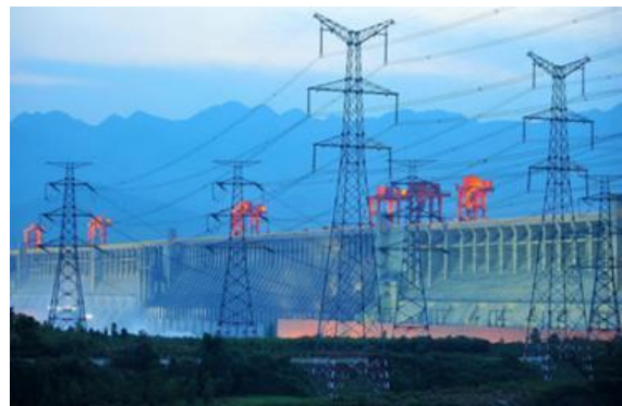
Figure 4. Power generation in Three Gorges Dam

Power Generation – The three gorges dam is one of the important component for the China's energy program as well as the power production. The power generation is also significant as it is helpful in measuring the proportion of balance of the energy sources and hence the electricity is transmitted from west to east and also unifying the electricity supply arrangement for the entire country. It is noted that the total capacity installed for the three gorges dam is approximately 18,200 MW having the normal input of 84.7 TWh. After all that aspect it is concluded that the Three Gorges Project is supposed to be the leading station for the national grid in the future aspect of Three Gorges Dam Project (Huang and Wu, 2018)