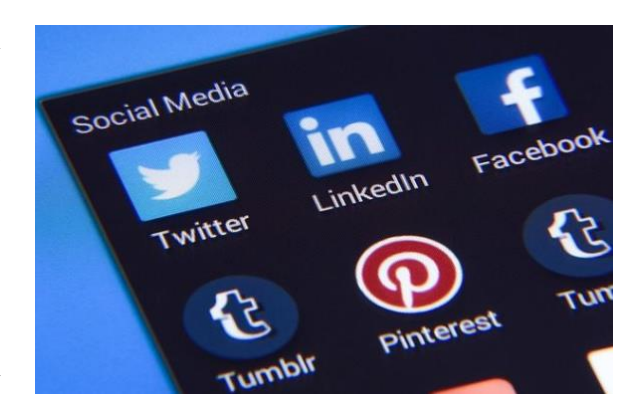
Figure 2 – Types of social networking sites

A study on the basis of Croatian found that the time, high school students are spending on facebook is correlated positively with depression. Then Rosen et al cleared all the findings and found that users or volunteers who are spending more time online and those who have performed more of the management of the facebook image that is evidenced more clinical symptoms of depression. According to many researchers, some college students have reported higher number of facebook friends who are experiencing lower emotional adjustment to college life (Strickland, 2014). These SNSs enables every individual to manage their own kind of image and then by providing number of opportunities for selfpresentation that should be selective by photos, personal details and comments. All these sites force the specialists of health care to consider again the processes of Psychology. According to various researchers, Social networks have successfully been used that aims at the diagnosis of depression among the college going students, who usually display the symptoms of depression on Facebook. So SNSs is considered to be innovative means for the purpose of identification of young individuals at the risk of depression. Studies and opinions of different experts recommends the use of social media that might have a major beneficial effect on children and adolescents by improving the communication, social connection and even the technical and operational skills (Amato et al 2012).