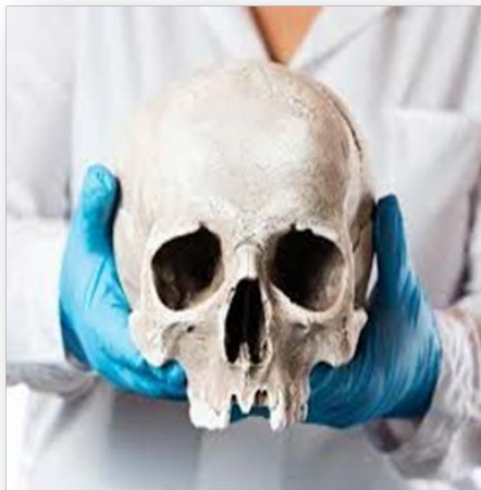
Figure No. 1: Human Skull model

Forensic anthropology is the study of the distinguishing characteristic on a person's remains. These distinguishing features can be utilized to demonstrate from a victim's remains the victim's gender, ethnicity, height, age, bone trauma and physical condition. The application of physical anthropology to the legal system is known as forensic anthropology (Upadhyay and Amarnath, 2021). To classify human remains and assist in the identification of crimes, forensic anthropologists use conventional scientific methods originally developed in physical anthropology.