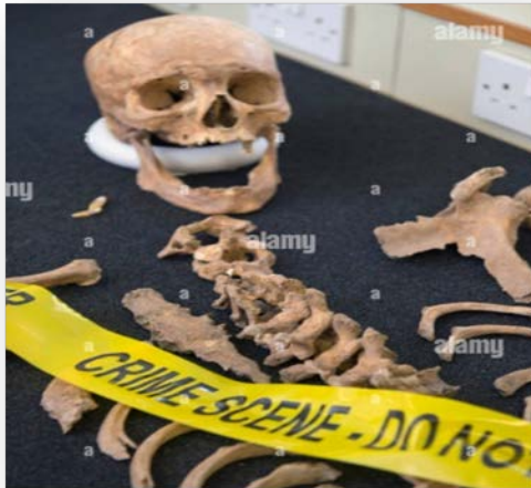
Figure No. 2: Skeleton remains from the Crime scene