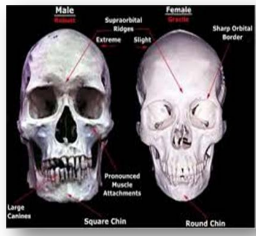
Figure No. 4: Gender identification using skull

Determining the person's biological gender is frequently one of the most important questions pertaining to skeletal remains in the complex field of forensic anthropology. By carefully analyzing skeletal traits and indicators, forensic anthropologists use a multimodal method to decipher gender secrets encoded in bone. Together, we will delve into the intriguing field of gender determination and examine the techniques used by forensic anthropologists to unravel this essential facet of the human experience.