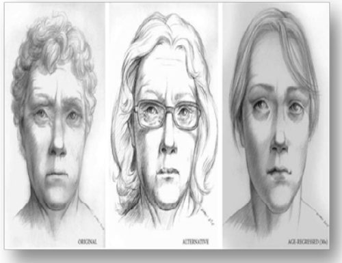
Figure No. 5: Facial reconstruction