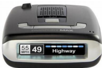
Figure 2 - Radar Detector

• Radar Detectors – The radar detectors are one of the technology used by the law enforcement agencies which is helpful in measuring the speed of a moving vehicle use a Doppler radar to beam a radio wave at vehicle. But it is less accurate and radio interference.