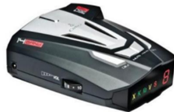
Figure 3 – Lidar Detector

• Lidar Detector - It is also known as laser detector which is a passive device considered to detect and observe the infrared emission for the detection of the speed and warn motorists that their speed is measured. It is low in cost but cannot be used while a police car is in motion as it require the operator to actively target each of the vehicle.