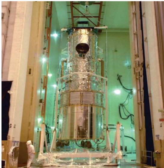
Figure 2 – Hubble Space Telescope