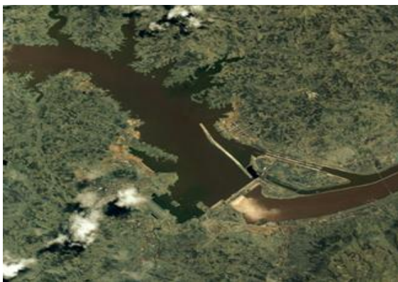
Figure 4 Environmental impact of three gorges dam

Power Generation – The three gorges dam is one of the important component for the China's energy program as well as the power production. The power generation is also significant as it is helpful in measuring the proportion of balance of the energy sources and hence the electricity is transmitted from west to east and also unifying the electricity supply arrangement for the entire country. It is noted that the total capacity installed for the three gorges dam is approximately 18,200 MW having the normal input of 84.7 TWh. After all that aspect it is concluded that the Three Gorges Project is supposed to be the leading station for the national grid in the future aspect of Three Gorges Dam Project (Huang and Wu, 2018)