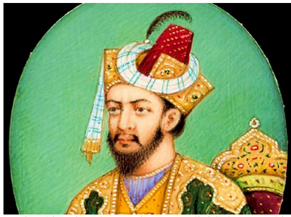
During his reign the province was divided among his brothers and cousins by the order of his father. He had given governorship of different provinces in following manner:

Xournals Academic Journal of Historical Studies