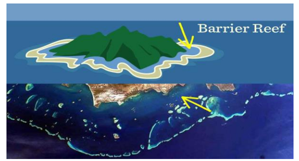
Figure 3: Barrier Reef; Pic Credit: thinga.com

Barrierreefs : These reefs are also found at the parallel areas of the coastline but these are separated by deeper, and wider lagoons and are present at the shallowest points of the lagoons. Its name has been based on the fact that these type of reefs can reach the water's surface by forming a barrier to navigation. Australian reef also known as the "Great Barrier Reef" is the most famous and the biggest reef that one can see.