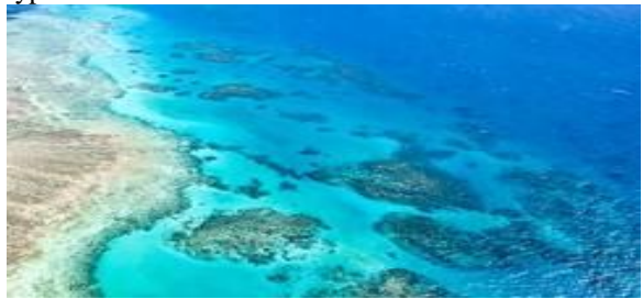
Figure 5: Patch Reef; Pic Credit: Coral reef info.com

Some such as Darwin think patch reef as micro scale reef that is feature of all three of the macro scale reef types.