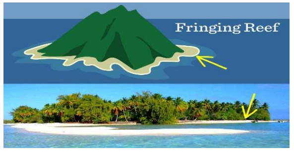
Figure 2: Fringing Reef; Pic Credit: thinga.com

Barrierreefs : These reefs are also found at the parallel areas of the coastline but these are separated by deeper, and wider lagoons and are present at the shallowest points of the lagoons. Its name has been based on the fact that these type of reefs can reach the water's surface by forming a barrier to navigation. Australian reef also known as the "Great Barrier Reef" is the most famous and the biggest reef that one can see.