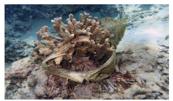
Figure 6: Coral wrapped inside plastic

He advised that debris seemed to be leading towards occurrence of coral diseases, hence they concluded that this increased the disease striking corals formation from 4 per cent to 89 per cent.