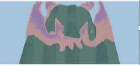
Figure 4: Atoll Reef; Pic Credit: Coral Reef Alliance

Atolls: Atolls are seen as the rings of coral that usually create protected lagoons and is mainly found at the center of the sea, these kind of reefs usually form when islands that are surrounded by fringing reefs sink into the sea or when the situation comes that the sea level rises around them. P.S- this sort of islands are often found on the top of underwater volcanoes. What really happens is that the fringing reefs continue to grow and end up eventually forming a circle with lagoons inside.