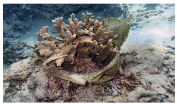
Figure 6: Coral wrapped inside plastic; Pic Credit: Lalita Putchim

He advised that debris seemed to be leading towards occurrence of coral diseases, hence they concluded that this increased the disease striking corals formation from 4 per cent to 89 per cent.