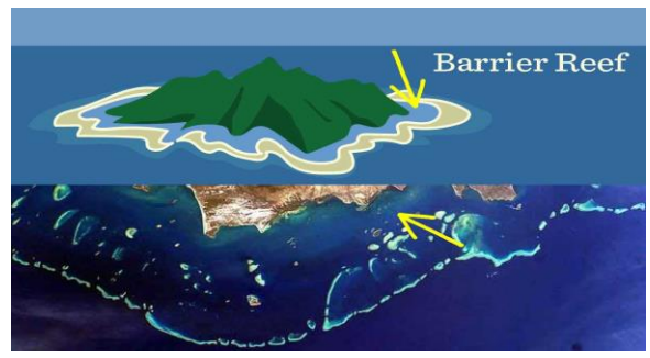
Figure 3: Barrier Reef; Pic Credit: thinga.com

Barrierreefs: These reefs are also found at the parallel areas of the coastline but these are separated by deeper, and wider lagoons and are present at the shallowest points of the lagoons. Its name has been based on the fact that these type of reefs can reach the water's surface by forming a barrier to navigation. Australian reef also known as the "Great Barrier Reef" is the most famous and the biggest reef that one can see.