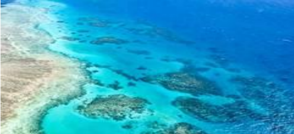
Figure 5: Patch Reef