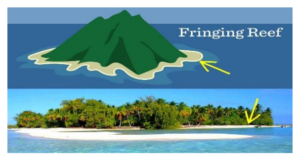
Figure 2: Fringing Reef

Barrierreefs: These reefs are also found at the parallel areas of the coastline but these are separated by deeper, and wider lagoons and are present at the shallowest points of the lagoons. Its name has been based on the fact that these type of reefs can reach the water's surface by forming a barrier to navigation. Australian reef also known as the "Great Barrier Reef" is the most famous and the biggest reef that one can see.