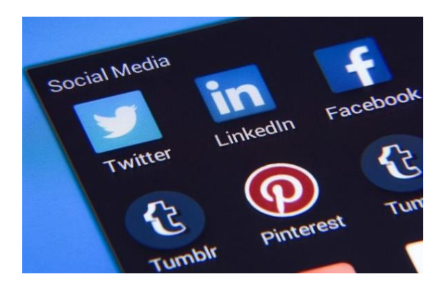
Figure 2 – Types of social networking sites

A study on the basis of Croatian found that the time, high school students are spending on facebook is correlated positively with depression. Then Rosen et al cleared all the findings and found that users or volunteers who are spending more time online and those who have performed more of the management of the facebook image that is evidenced more clinical symptoms of depression. According to many researchers, some college students have reported higher number of facebook friends who are experiencing lower emotional adjustment to college life (Strickland, 2014). These SNSs enables every individual to manage their own kind of image and then by providing number of opportunities for selfpresentation that should be selective by photos, personal details and comments. All these sites force the specialists of health care to consider again the processes of Psychology. According to various researchers, Social networks have successfully been used that aims at the diagnosis of depression among the college going students, who usually display the symptoms of depression on Facebook. So SNSs is considered to be innovative means for the purpose of identification of young individuals at the risk of depression. Studies and opinions of different experts recommends the use of social media that might have a major beneficial effect on children and adolescents by improving the communication, social connection and even the technical and operational skills (Amato et al 2012).